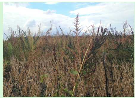
Michigan soybean field infested with waterhemp

Due to the limited postemergence (POST) herbicide options available, label restrictions, and lack of consistency observed with postemergence herbicides control of multiple-resistant Palmer amaranth and waterhemp is a challenge in Roundup Ready soybean. With LibertyLink, LibertyLink GT27, and Enlist E3 soybean there is more flexibility in use rates and the number of glufosinate (Liberty, Interline, Scout, others) applications that can be made. Information on glufosinate use for POST control of Palmer amaranth and waterhemp is outlined in Step 3.